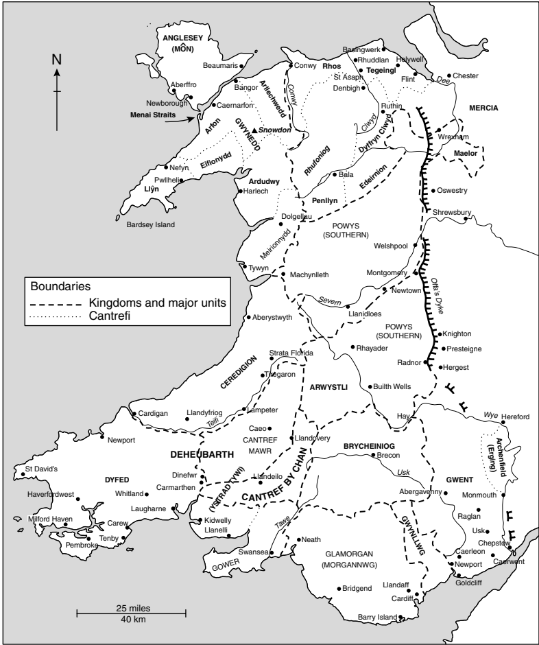
The main divisions of Wales before 1100 and the main Market Towns and Abbeys in medieval Wales